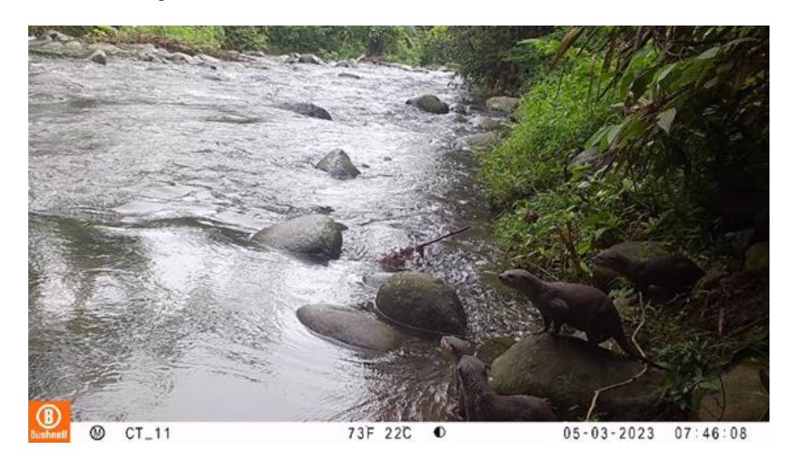
Figure 4. Aonyx cinereus

At a different time, on May 3, 2023, from 7.46 to 7.52 WIB, near the first L. lutra discovery, approximately 50 meters downstream, i.e. close to a part of the river where the water level is rather deep, a group of four Aonyx cinereus otters was seen on the riverbank, and then one individual jumped into the river and swam to find food downstream (Fig. 4).