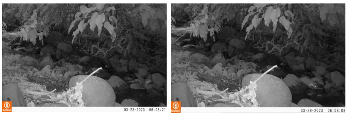
Figure 2. Lutra lutra

Our camera trap results found three species of otter: Lutra lutra , Lutra sumatrana and Aonyx cinereus . The location where these were recorded was on the Mangun River, quite close to each other, but at different times of day. The first otter was recorded on March 28, 2023, at 06:08 WIB: an individual Lutra lutra (Fig. 2) looking for food in the Mangun tributary with a video duration of 30 seconds (https://youtu.be/NbnUjlgc9c0).