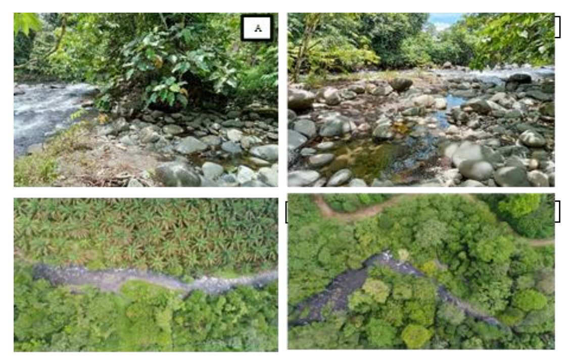
Figure 6. (A): Riverbank location of Eurasian Otter sighting. (B): The tributary on which the Eurasian Otter was sighted. (C): Mangun with oil palm plantations on the north side. (D): Secondary forest around the Mangun river.

The evidence of L. lutra and L. sumatrana in the PR-HSD of the Mangun River implies the existence of a population of these two species of otter may have lived in the area for some time. However, current findings of L. lutra in the wild are very limited compared to L. sumatrana (though the latter is considered more endangered: Sasaki et al, 2021) (Fig 6.).