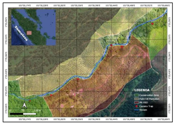
Figure 1. Location of the camera traps

The Dharmasraya Sumatran Tiger Rehabilitation Centre (PR-HSD) is located in the 2400 hectare Prof. Sumitro Djojohadikusumo Conservation Forest (AK-PSD), set aside from the 27.000 hectare palm oil plantation site belonging to PT. Tidar Kerinci Agung (TKA), managed under the Cultivation Right (HGU), in Dharmasraya Regency, Nagari Lubuk Besar, Asam Jujuhan District, Dharmasraya Regency, West Sumatra (1°35'30.5" S, 101°30'19.3" E) (Fig. 1). PR-HSD is one of the Arsari Djojohadikusumo Foundation programs which focus on the rescue, rehabilitation, and release activities for sumatran tigers in West Sumatra. PR-HSD and PT. TKA are tied to cooperation under the law that allows PR-HSD to operate within the area.