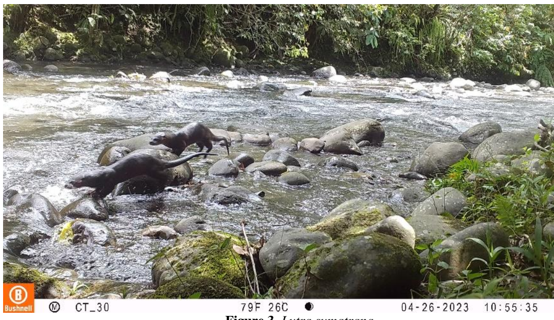
Figure 3. Lutra sumatrana

At a different time, on May 3, 2023, from 7.46 to 7.52 WIB, near the first L. lutra discovery, approximately 50 meters downstream, i.e. close to a part of the river where the water level is rather deep, a group of four Aonyx cinereus otters was seen on the riverbank, and then one individual jumped into the river and swam to find food downstream (Fig. 4).